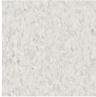
GRTSD-JT 395 Light Grey TB3 Dover CG*