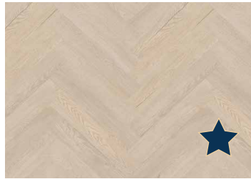
Carroll Gardens ACX502