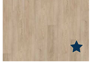
Cobble Hill GEN829