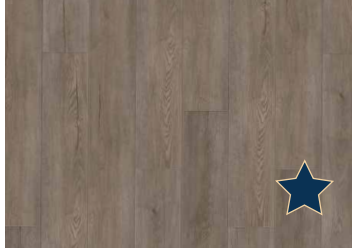
Park Slope GEN827

22.38 ft 2 /ctn 48 ctn/plt 1074.24 ft 2 /plt