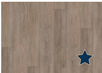
St John GEN819