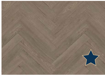
Park Slope ACX503

16.95 ft 2 /ctn 60 ctn/plt 1017 ft 2 /plt