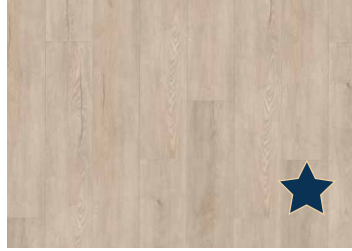
Carroll Gardens GEN828