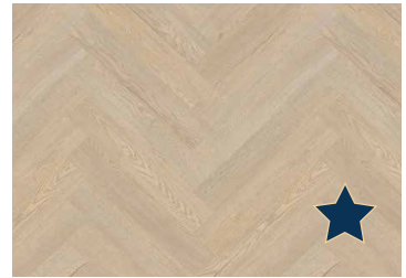
Cobble Hill ACX501