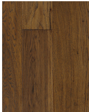
POMINO HICKORY DMTS-H06