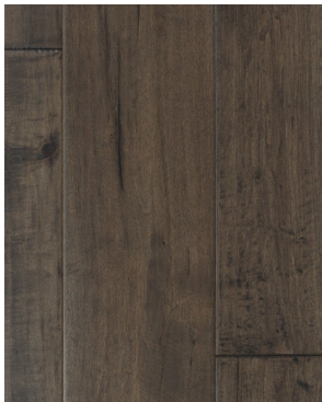
FRESCOBALDI MAPLE DMTS-M13