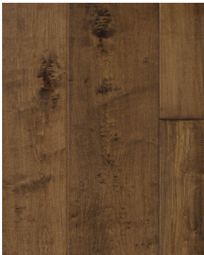
CORTONA MAPLE DMTS-M12