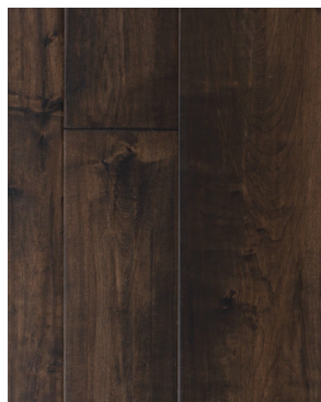
DOLCETTO MAPLE DMTS-M14