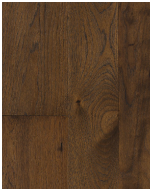
BRUNELLO* HICKORY DMTS-H02