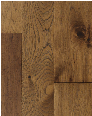
FONTANA* HICKORY DMTS-H01