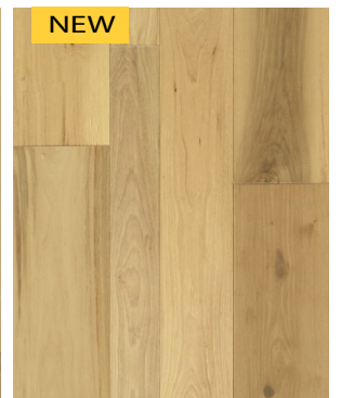
MOSCATO HICKORY DMTS-H09Y