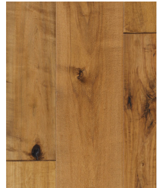
AZELIA MAPLE DMTS-M10