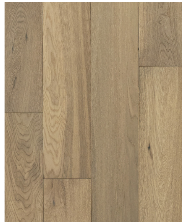
GREY LAGOON MCST1012