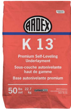
K 13 K 13 50