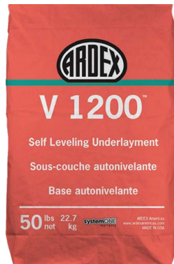
V 1200 V1200 50