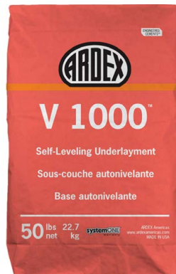
V 1000 V1000 50