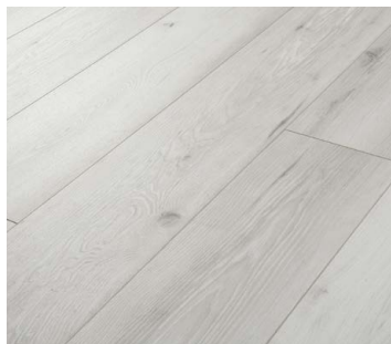
Mountain Air AP107MA