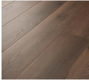
Barkers Point AP107BP