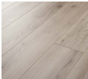
Prospect Point AP107PP