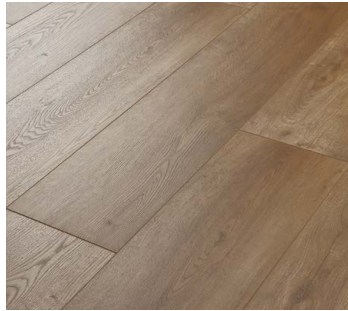
Fox Hollow AP107FH