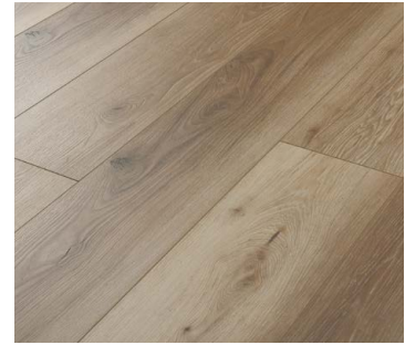
Cedar Knoll AP107CK