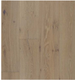
Kilim Beige BH537OKB

23.5 ft 2 /ctn 50 ctn/plt 1175 ft 2 /plt