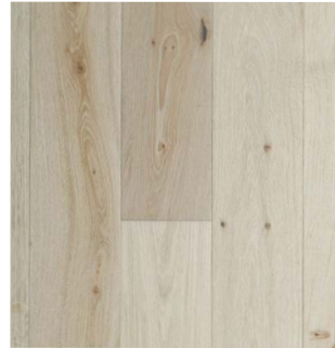
Ivy Point BH537OIP