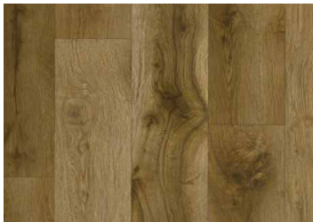
Crystal Cove CHFPPC-CRC