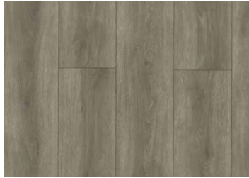
Stepping Stone CHFPPC-STS