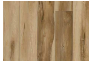
Down to Earth CHFPPC-DTE