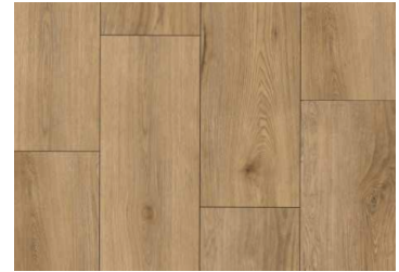
Seaside Village CHFPPC-SDV