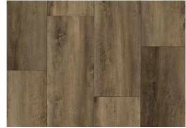
Beautiful Beige CHFPPC-BTB