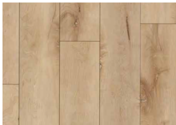
Washed Maple CHFPPC-WAM