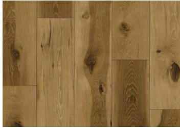
Aged Pecan CHFPPC-AGP

22.12 ft 2 /ctn 72 ctn/plt 1592.64 ft 2 /plt