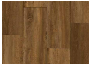
Time Capsule CHFPPC-TMC