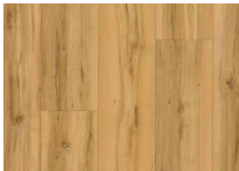
Family Tree CHFPPC-FLT