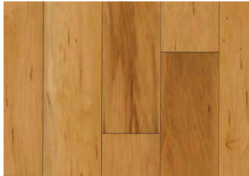
Classic Hickory CHFPPC-CSH