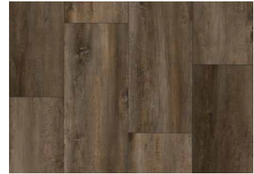
Castle Rock CHFPPC-CTR