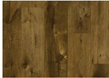
Reclaimed Barnwood CHFPPC-RCB