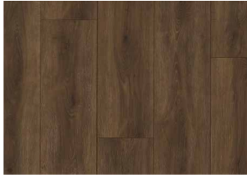
Enchanted Forest CHFPPC-ENF

23.39 ft 2 /ctn 72 ctn/plt 1684.08 ft 2 /plt