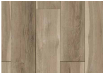
Spot On CHFPPC-SPO