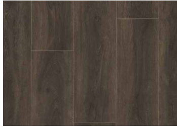
Glory Days CHFPPC-GRD