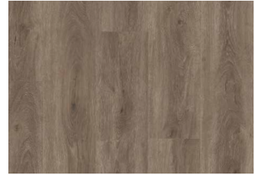
Sand Dune CHFPPC-SND