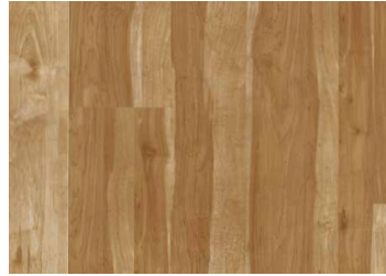
Nature's Way CHFPPC-NATW