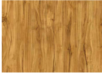
Amber Eyes CHFPPC-ABE