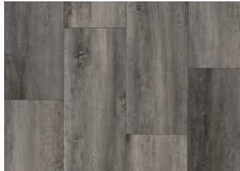
Cloud Nine CHFPPC-CDN