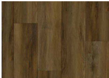
Dark Roast CHFPPC-DRT