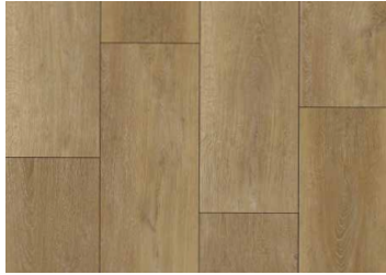
Memory Lane CHFPPC-MRL

22.12 ft 2 /ctn 72 ctn/plt 1592.64 ft 2 /plt