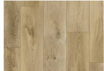
Coastal Range CHFPPC-CSR