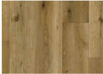
Tortoise Island CHFPPC-TTI