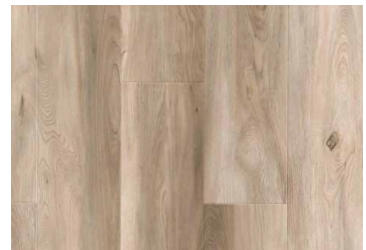
Half Moon Bay CHFPPC-HMB