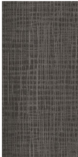
887 039 Relic