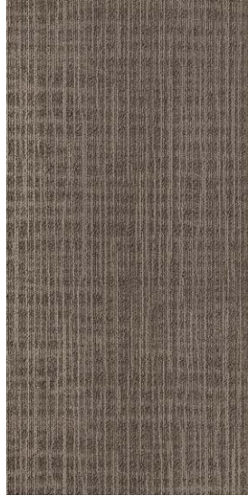
887 002 Arrowhead