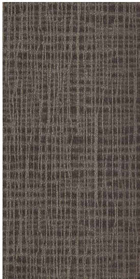
887 033 Harvest