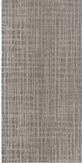
887 001 Sterling