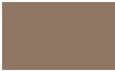
Sandalwood WG 45