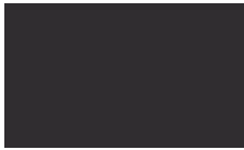
Burnt Umber 63