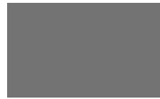
Grey WG 48