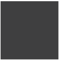
40 Black B RS40